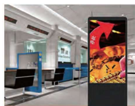
Banking & Finance